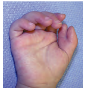
Figure 3: Thumb polydactyly, with duplication of the thumb

All babies born with congenital hand differences should be evaluated by a hand specialist to make an individual assessment of the type. Depending on the type of congenital hand difference, treatment may be recommended. For example, webbed fingers are surgically separated. Extra digits can be surgically removed with reconstruction of the remaining digit if necessary. Hand function can be improved if the functions of thumb pinch or finger grasp is compromised. Some congenital hand differences may need therapy to help improve hand function. In some cases, no intervention is necessary. More information on congenital hand differences can be found at the American Society for Surgery of the Hand website, www.assh.org , in the Patient and Public section called "Hand Conditions."