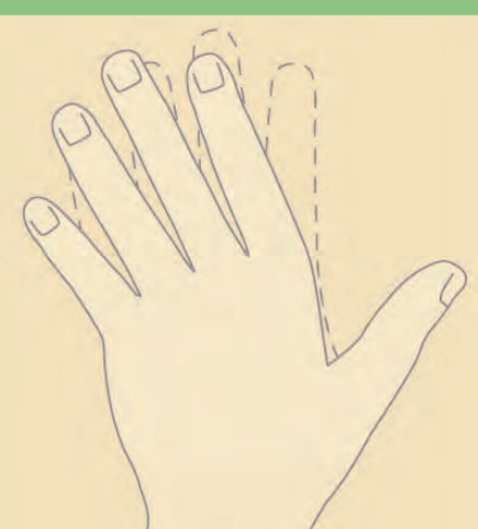
Figure 2: Drift of the fingers away from the thumb