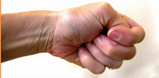
Figure 2 and 3: Finkelstein maneuver, a helpful test to diagnose de Quervain's Tendonitis. Figure 2 shows the first dorsal compartment relaxed; Figure 3 shows the compartment stretched when the fist is bent toward the little finger.

Tenderness directly over the tendons on the thumb-side of the wrist is the most common finding. A test is generally performed in which the patient makes a fist with the fingers clasped over the thumb. The wrist is then bent in the direction of the little finger (see Figure 2 and 3 ). This maneuver can be quite painful for the person with de Quervain's tendonitis.